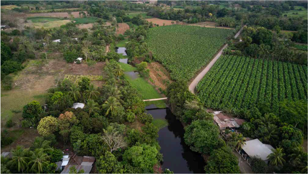
In recent years the palm oil industry has driven the takeover of community lands in Guatemala. Indigenous peoples and small-scale farmers, especially women, are facing ongoing threats; losing land and seeing the water increasingly polluted.

catalysing large-scale PPPs, 19 developing countries have set up NVA Country Partnerships that have mobilised $10.5 billion in investment commitments. 110 At global level, the New Vision for Agriculture has partnered with the G8 and G20, linked up with the Alliance for a Green Revolution in Africa (AGRA), heavily funded by the Bill & Melinda Gates Foundation, and facilitated high-level informal dialogues that have spawned initiatives such as the New Alliance for Food Security and Nutrition in Africa (see below). 111 The New Vision was also the launch pad for its two main regional investment ‘partnership platforms’: Grow Africa and Grow Asia.