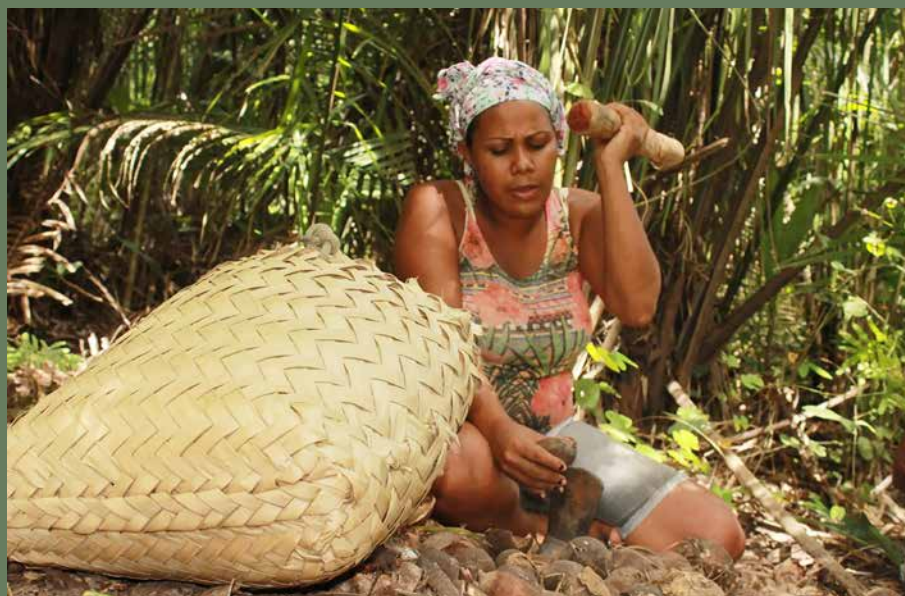
Over 300,000 women who make their living from gathering babassu palm tree coconuts are part of the Coconut Breakers' Movement (MIQCB).

Supporting the key agents fighting climate change, both in Brazil and globally, means supporting indigenous and traditional peoples and rural movements, especially those with women in key leadership positions. 87