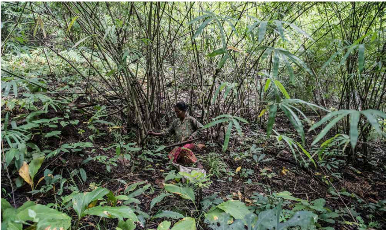
The Rovieng community in Preah Vihear province depends upon the forest for their livelihood; forest vines hold their timber homes together, and fallen trees provide firewood. They pick bamboo shoots to sell, and forage for traditional medicines.

ActionAid seeks a major paradigm shift to tackle the global climate emergency and gender equality crisis. We urge support for public policies that put women and young people at heart of policies and policy making; policies that are human rights-based and youth-focused, which draw from a feminist analysis, and that increase community access, ownership and control of land, the commons and natural resources. Finally, we require fully scaled-up and properly implemented laws, policies and practices that help ensure climate justice through a major shift towards food sovereignty and agroecology and a radical transformation towards rebuilding diverse local food systems. Below we highlight key policies that hinder and enable rural women and young people's livelihoods and climate justice, and we identify key advocacy threats and opportunities.