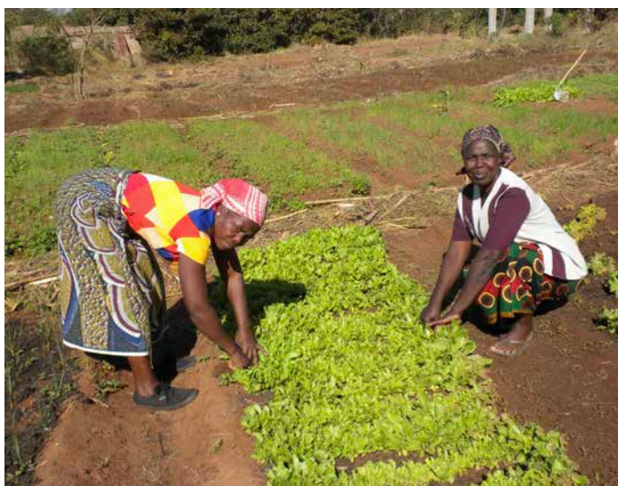
These women are part of the Agroecology Knowledge Exchange in Marracuene, Mozambique. They are involved with the preparation of natural pesticides.

Wholeheartedly committing to food sovereignty and scaling up agroecology are key components of the transition to low-carbon food systems. Food sovereignty, as articulated by the global peasants movement La Vía Campesina, “is the right of peoples to healthy and culturally appropriate food produced through ecologically sound and sustainable methods, and their right to define their own food and agricultural systems”. 67 At national level, food sovereignty has so far been recognised in a number of constitutions and national framework laws. It is enshrined in the constitutions of Ecuador, Bolivia and Nepal and is further recognised in Bolivia's 2013 Law on Sustainable Family Farming and Food Sovereignty and in laws in Ecuador, Dominican Republic, Mali, Nicaragua, Senegal and Venezuela. 68