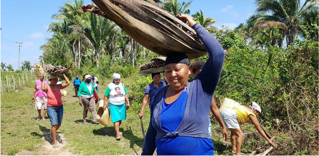
The women have become increasingly organised to both defend their right to free access to gather the babassu nuts from the palm trees that grow wild, and to improve their trading position.