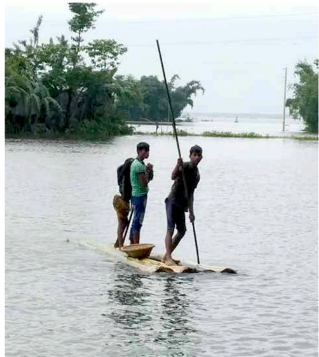
Young men navigate around their district in Durgapur, Bangladesh where havoc has been wreaked due to flash floods.