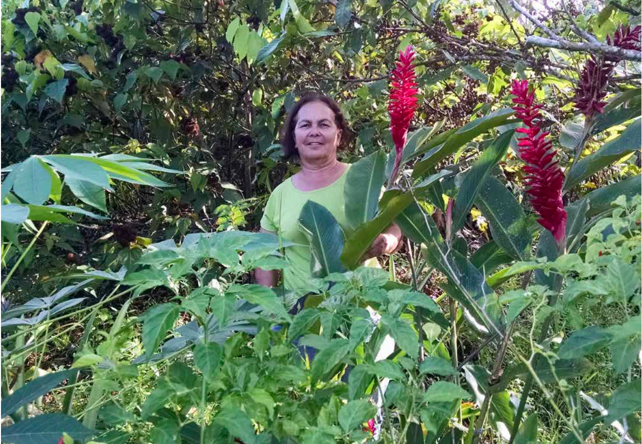
This farmer from Brazil has received support from the agroecology network Sabia, and now produces enough to be able to sell the the national school feeding programme.