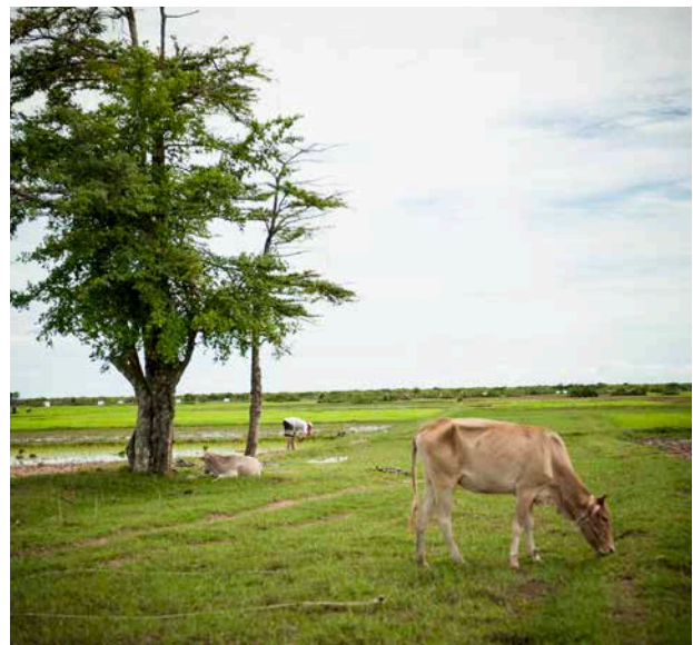
This community in Pursat, Cambodia receive livelihood support including trainings on farming and livestock and provision of seeds.

to joint titling and to inherit communal land, and the right of widows to remain on communal land is protected. While land continues to be allocated by male and female traditional leaders, women's rights to participation are protected through mandates that ensure five women are represented on powerful 12-person Community Land Boards, which ratify all land allocations. Individual and collective land title-related sex-disaggregated data is also routinely collected. 65