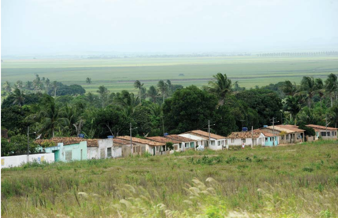
The increasing value of flat land proper to mechanization is displacing smallholders and taking the job of sugar cane cutters