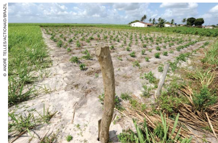
Sugar cane harvest grow towards food production

The expansion of monoculture sugar cane represents a socio-economic and environmental threat. Some issues include the removal of small farmers from their land, unemployment, food insecurity, health problems among the workers who harvest the cane, and the depletion of the soil, among others. Municipal producers in the states with currently the most expansion, Rubiataba in Goiás, Mirassol d'Oeste and Lambari d'Oeste, in Mato Grosso; and the region around Ribeirão Preto, in São Paulo, exemplify the issues.