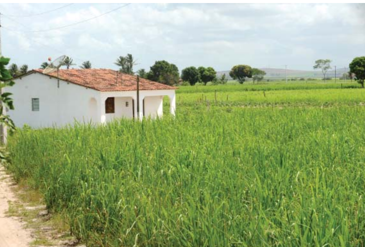
Renters lose space for growing food and raise cattle

In addition, removing the trees, gardens, sometimes even the houses from the property makes a return to the property that much more unlikely, and means lease contracts are systematically renewed.